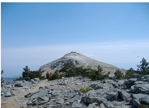
Blonde Girl Hill